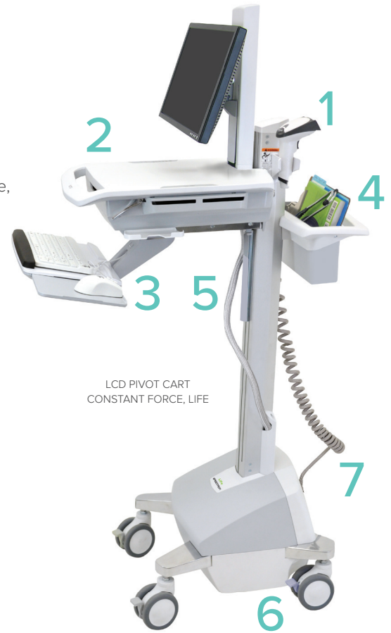
LCD PIVOT CART CONSTANT FORCE, LiFe

Durable, easy-to-clean exterior composed of aluminum, high-grade plastic and zinc-plated steel